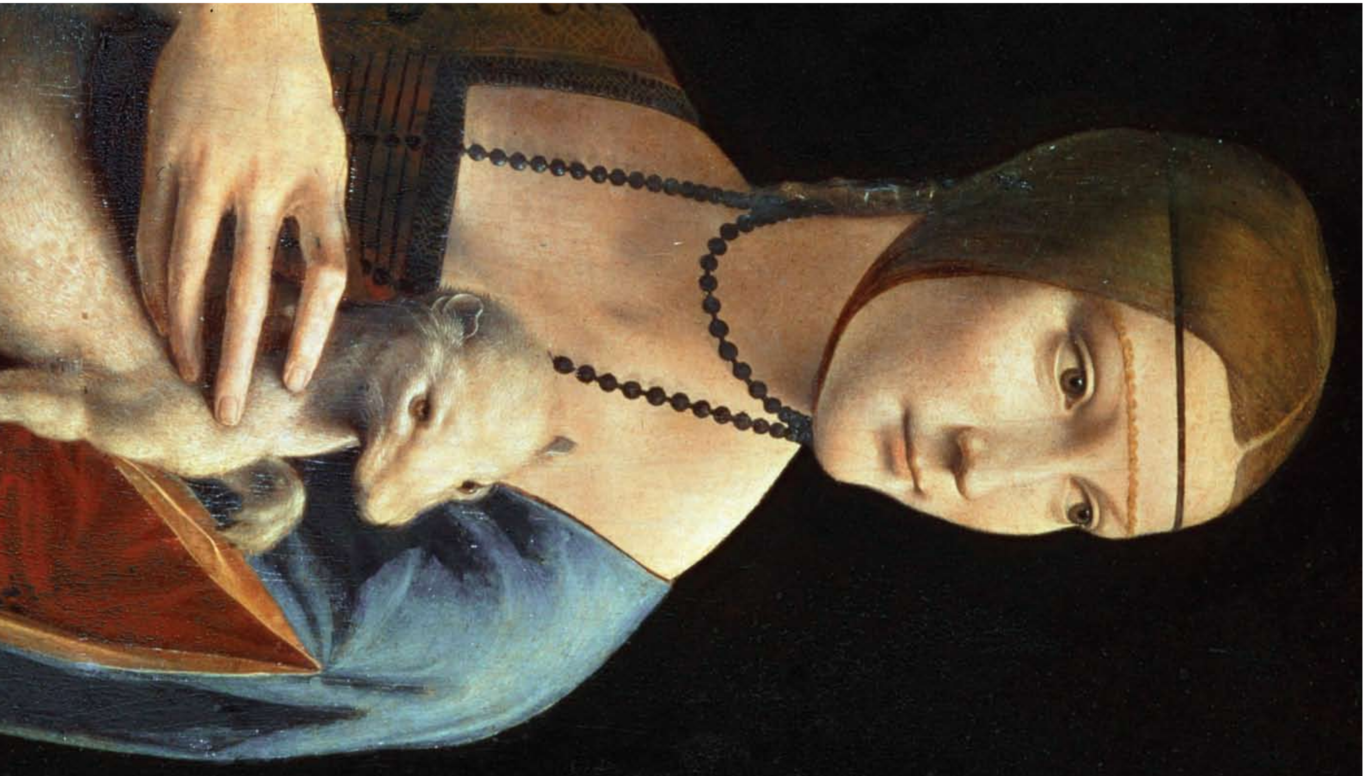
Cover: Leonardo da Vinci (1452 – 1519), Lady with an Ermine (detail), Ca. 1490. Oil on walnut, 54.8 x 40.3 cm. Czartorysky Museum, Cracow, Poland